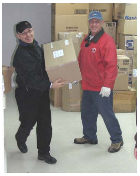
Loading our last shipment of medical supplies.

Hospital practice namely in North America has changed quickly in the past decade. For one thing, hospitlas use more and more disposable supplies in order to minimize need for sterilization. This is because standards of sterility have been constantly raised.